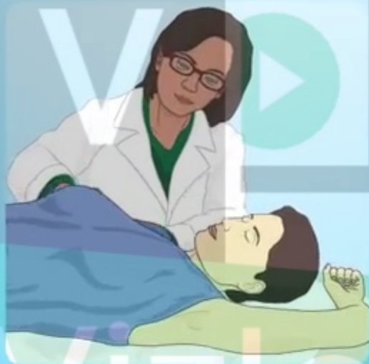
Clinical breast exam by your healthcare provider