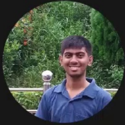
1606009 - Nafis Sadik